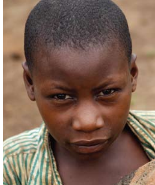
Emmanuel Face survival in the wild, as a young boy and his brother care for themselves after losing their mother and their home in Uganda.