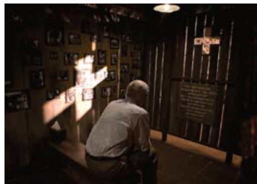
The chapel provides visitors with a space for prayer and reflection.