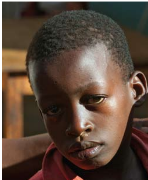
Kombo Avoid the big trucks and the big disease as they roll past one boy's home at a truck stop along the "AIDS highway."