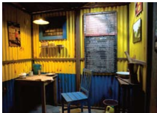
Detailed vignettes, such as this restaurant along the "AIDS highway" in Kenya, draw visitors into each child's story.