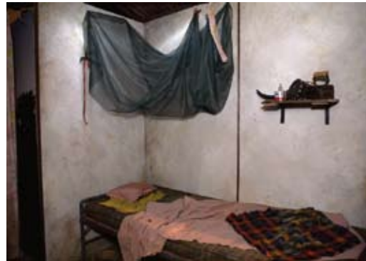
The rooms in the exhibit provide visitors with a life-sized view into the world of an African child. Visitors can "step into" a fishing village in Uganda, a truck stop in Kenya, or the mountains of Lesotho, for example.